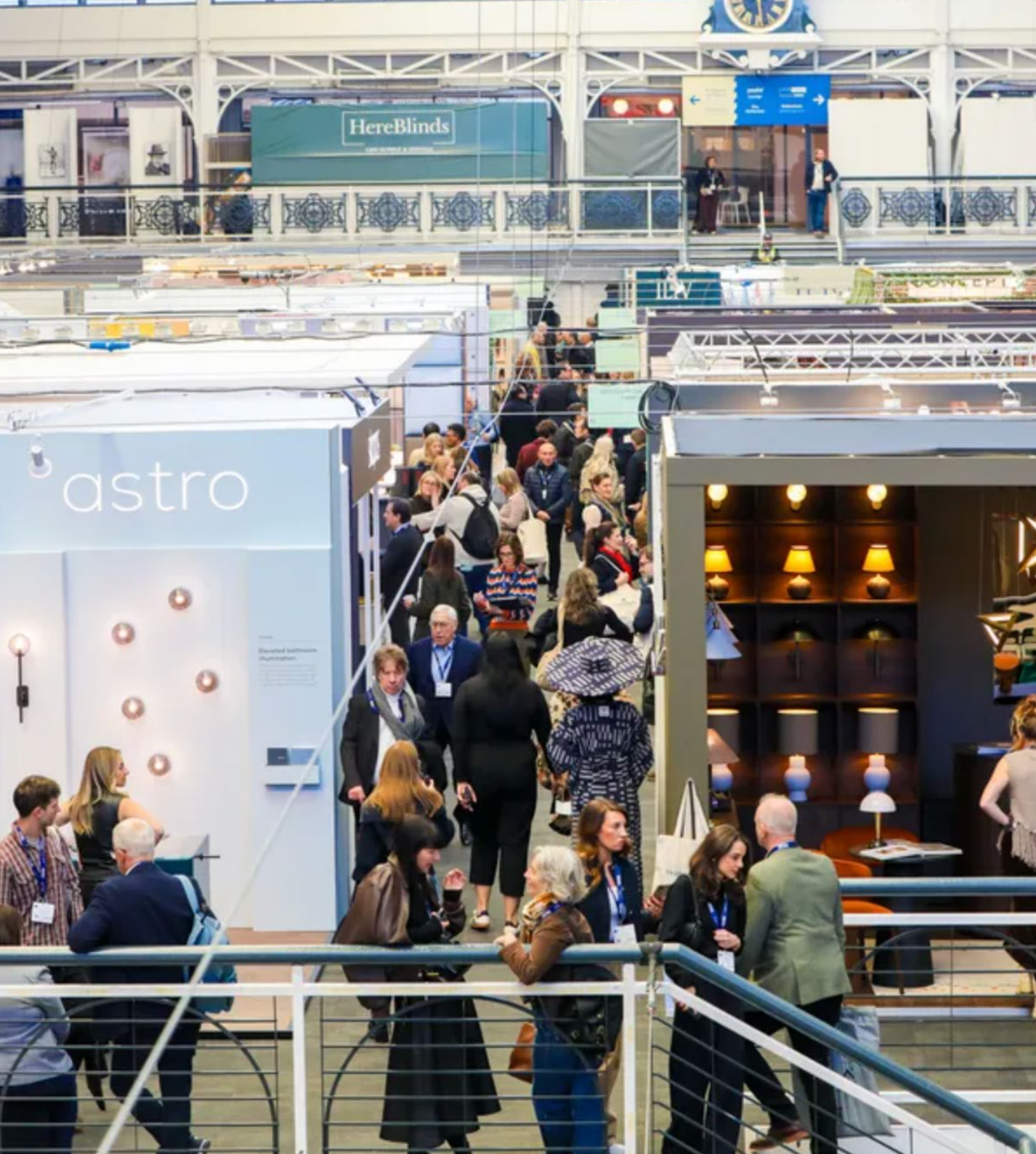
Exhibit at stadia expo

stadia expo is the only event laser-focused on the specific, high-stakes needs of the sporting venue ecosystem.